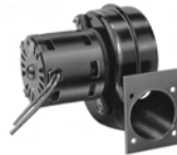
FIG. H A151