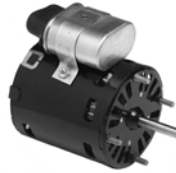
FIG. C D1122