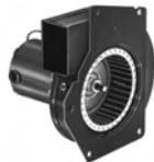
FIG. G A148