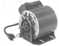
FIG. J D880, D827