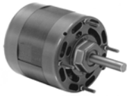
FIG. A D1061

NOTES: 1: 4M 370V capacitor 22: 2M 370V Capacitor