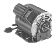
FIG. I D829