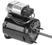
FIG. B A133, D1123