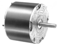
FIG. F D1071