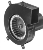
FIG. D A064